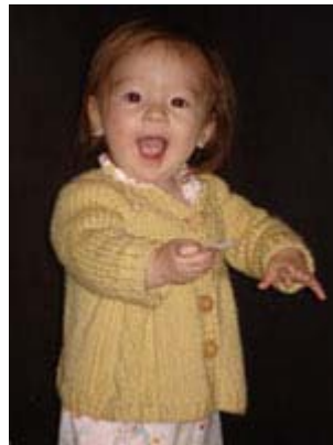
#66 Beautiful Cabled Baby Jacket