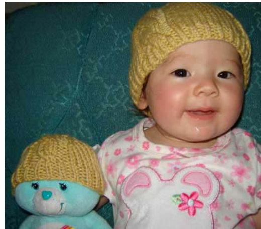
Shown in 6-12 months size (on baby) and Toy size (on Bashful Heart Bear).

Please visit http://www.sweaterbabe.com/abbr.htm for a list of standard knitting abbreviations.