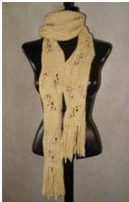
#68 Sinuously Curved Lace Scarf

Other SweaterBabe.com patterns you may like for your next project. . .