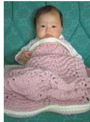
#16 Chunky Knit Baby Blanket

Visit www.SweaterBabe.com for the complete selection of Knitting Patterns, including the latest FREE patterns.